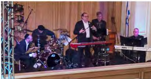
Los Angeles Festivities for the Nineteenth of Kislev - 6

בטב' כסליו - יד' טבת • DECEMBER 29 - JANUARY 12 • VOL 4, #28