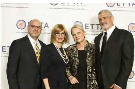
What the World Needs Now is a Little More ETTA - 10